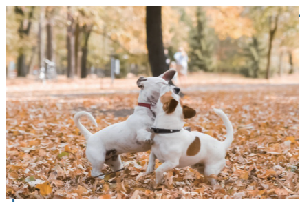
Suitable for outdoor