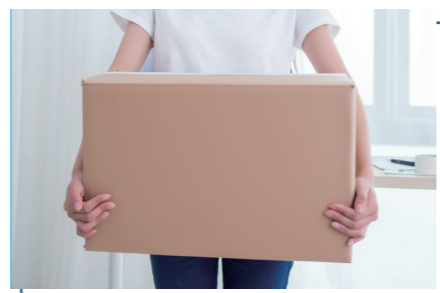
Easy for transportation