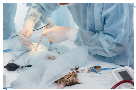
Installed in hospital