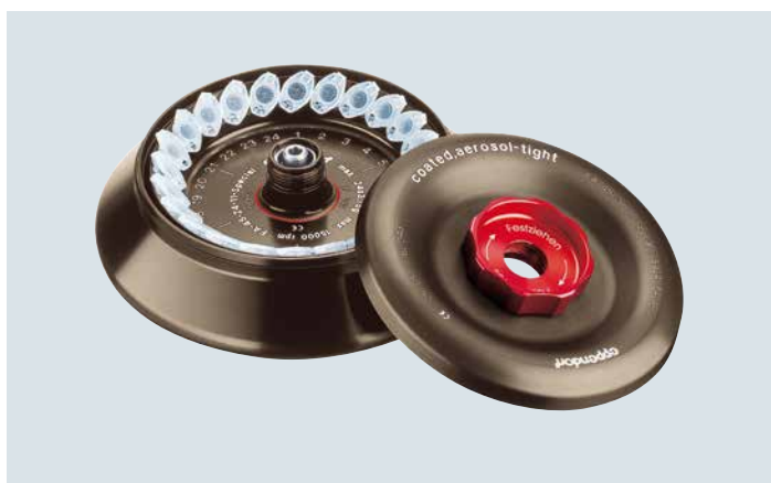
Aerosol-tight rotor for 24 × 1.5/2 mL tubes with PTFE-coating for high chemical resistance. Provides speed up to 21,130 × g /15,000 rpm (FA-45-24-11-Special; Order no. 5424 700.004).