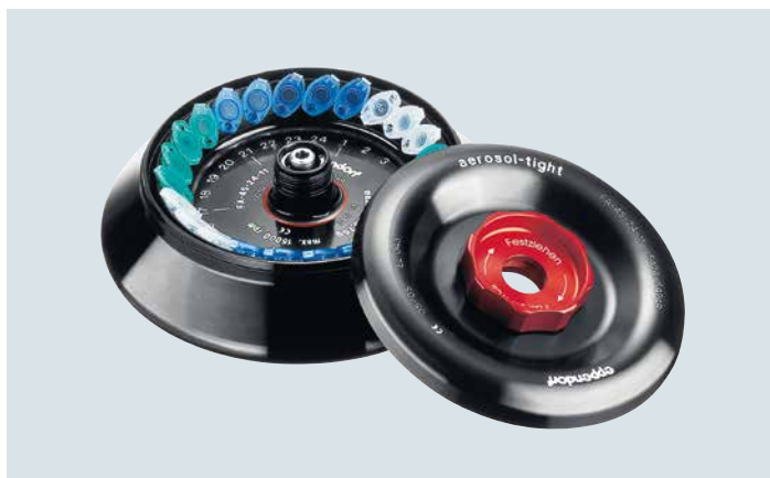
Aerosol-tight rotor for 24 × 1.5/2.0 mL tubes provides speed up to 21,130 × g /15,000 rpm. (FA-45-24-11; Order no. 5424 702.007).