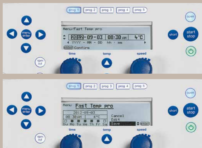
Energy savings overnight with ECO shut-off and FastTemp pro

In addition to the standard FastTemp pre-cooling program Eppendorf Centrifuge 5430 R features a unique software option called FastTemp pro. This program allows for automated pre-cooling based on pre-programmable time and date. FastTemp pro can be set to a specific date or as a repetitive event during several days every week. Simply turn the centrifuge into standby mode when you leave your lab and let FastTemp pro take care of pre-cooling in the morning. This not only makes operation super easy, it also saves you up to 90 % of energy over night.