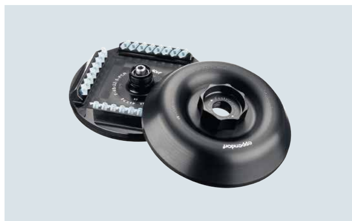
4 × PCR-strip rotor for centrifugation up to 18,615 × g /15,000 rpm (F-45-32-5-PCR; Order no. 5424 704.000).